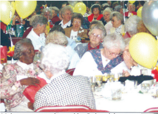
Volunteers gathered in Columbia to celebrate OATS 25th Anniversary, 1996