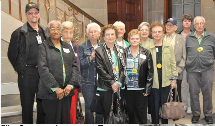
Pike County volunteers at Transportation Day at the Capital , 2017