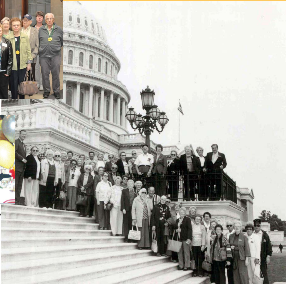
Volunteers went to Washington DC Trip in the early days in order to secure funding for OATS, Inc.