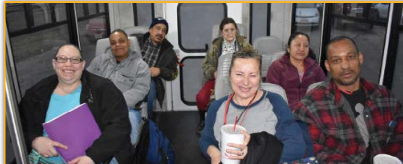
The Tyson Food Plant 6:30 a.m. shift all agree that the reliability and cost of utilizing the OATS Transit bus helps them overcome some of the barriers of getting to their place of employment.

The OATS Transit bus can accommodate 12 employees at a time and reservations are highly encouraged due to seat availability. "I've