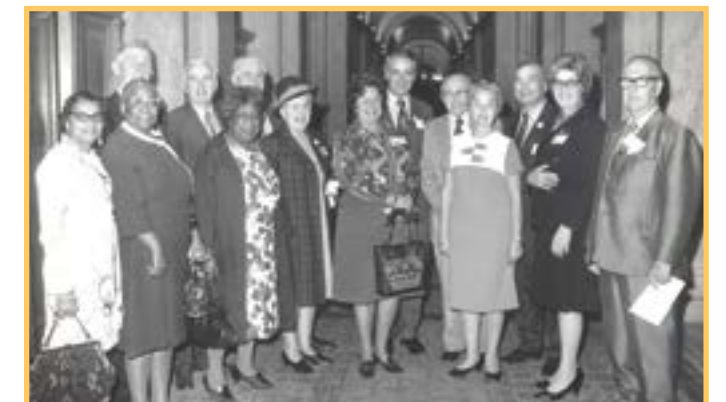
A group of volunteers visited Washington, D.C. in 1971, to advocate for rural public transportation.

If you are interested in volunteering for our organization, you can find a list of ways to help us at oatstransit.org/volunteer .