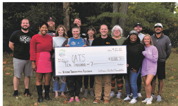
The Veterans United Foundation provided support to Veterans who live in the Mid-MO Region.