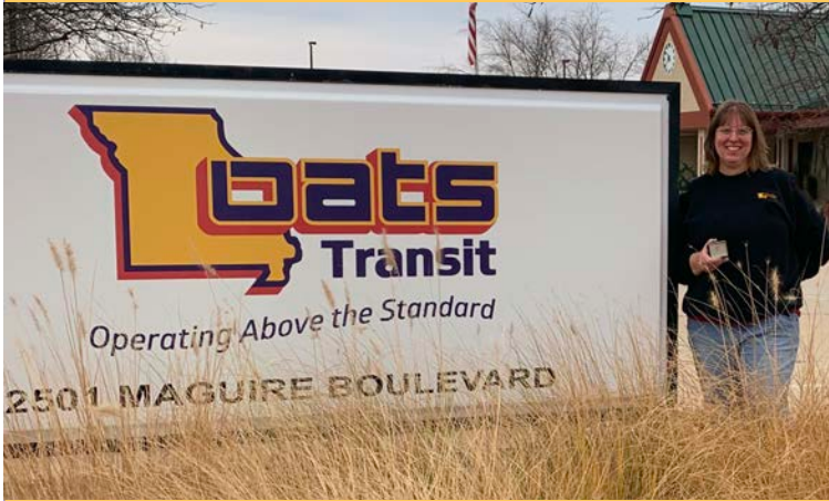
Lea Dzurick- 20 Years

The employees listed below celebrated an anniversary October - December 2020. Thank you to each of these employees for your hard work and dedication to OATS Transit!