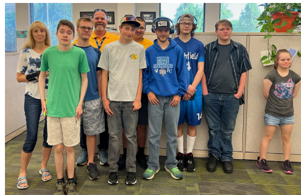
Riders from WC Partners stopped by the Springfield office to see all the behind the scenes work that happens to make their transportation possible.