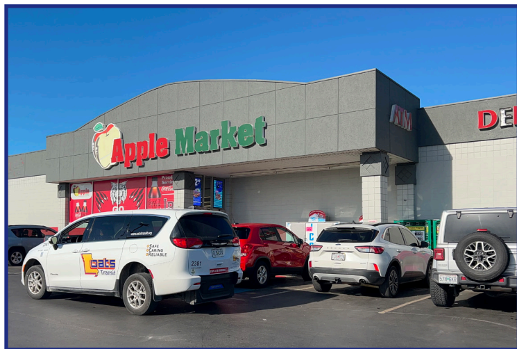
A frequent stop for riders on the bus is the Apple Market, which is the only grocery store in Rogersville.

In the end, investing in public transit isn't just about buses or routes- its about building the future that Rogersville deserves. As new families arrive, businesses expand, and opportunities grow, reliable transportation becomes the thread that keeps the community connected. Public transit isn't simply a convenience; it's a commitment to growth, resilience, and a thriving hometown for generations to come. So next time you are in the area, check out Rogersville and join the scavenger hunt to look for Roger the Raccoon !